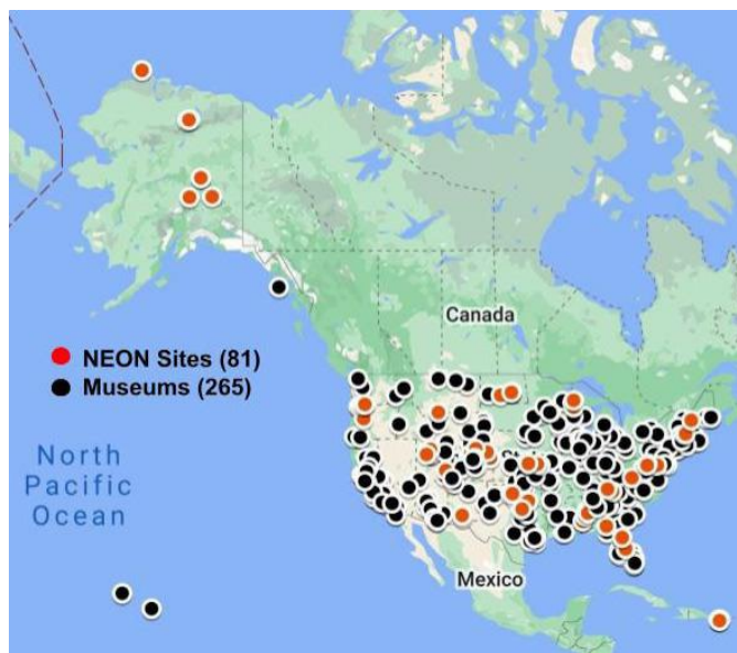
Fig 1. NEON sites and museum collections dispersed broadly throughout the U.S., providing access to a breadth of complementary data and resources.